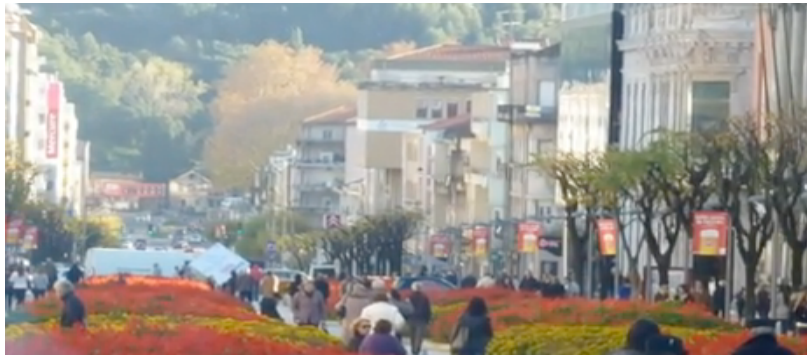
Braga is a colourful and important city.